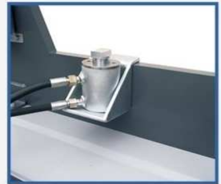
The mobile piston